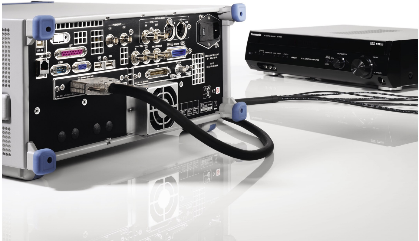
FIG 1 Speedy production: The new multichannel interface card enables the R&S®UPV audio analyzer to process up to 16 channels simultaneously.

In addition, your favorite music should also have the perfect sound in your car. The difficult acoustic conditions in an automobile and the little space available for accommodating the sound transducers prompted manufacturers of modern car hi-fi systems already some time ago not only to split up the audio frequency range among several loudspeakers but also to control the speakers via separate amplifier branches. The use of DSP-controlled sound-optimization circuits further