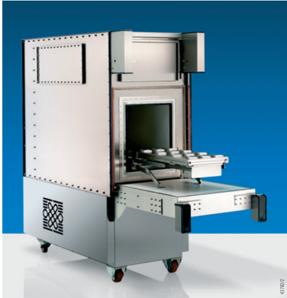
FIG 1 Extreme Temperature Tester R&S E-Line.

Mobile radio and automotive are two fields where individual components must function properly even at extreme temperatures. As a combined shielded enclosure, climatic chamber and multiplexer that can be program-controlled to test up to 12 DUTs in a wide temperature range, the Extreme Temperature Tester R&S E-Line provides the optimum measurement environment for functional checks of components with a radio interface.