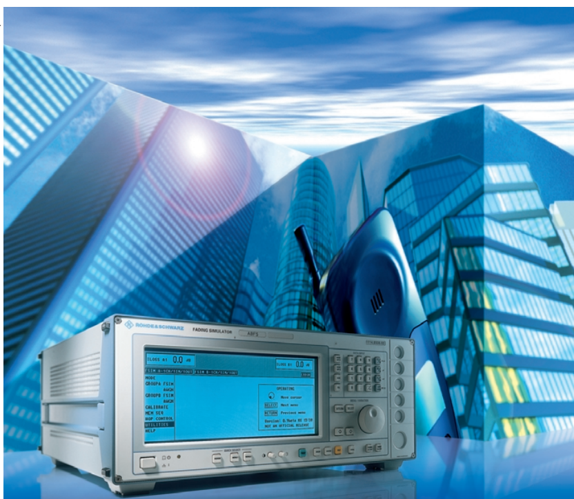
FIG 1 Baseband Fading Simulator ABFS – flexible radio channel simulation for all communication systems