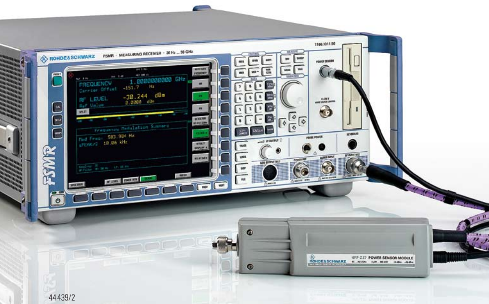
FIG 1 The R&S®FSMR with the Power Sensor Module R&S®NRP-Z37.